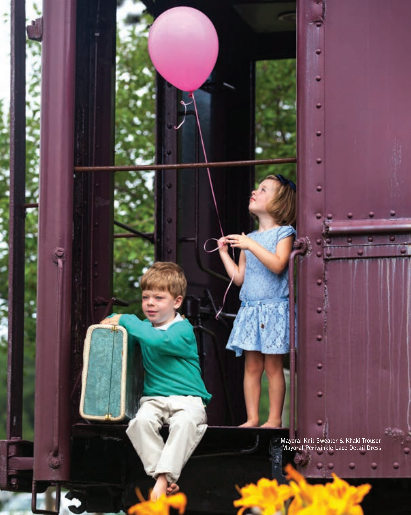
Mayoral Knit Sweater & Khaki Trousers Mayoral Periwinkle Lace Detail Dress