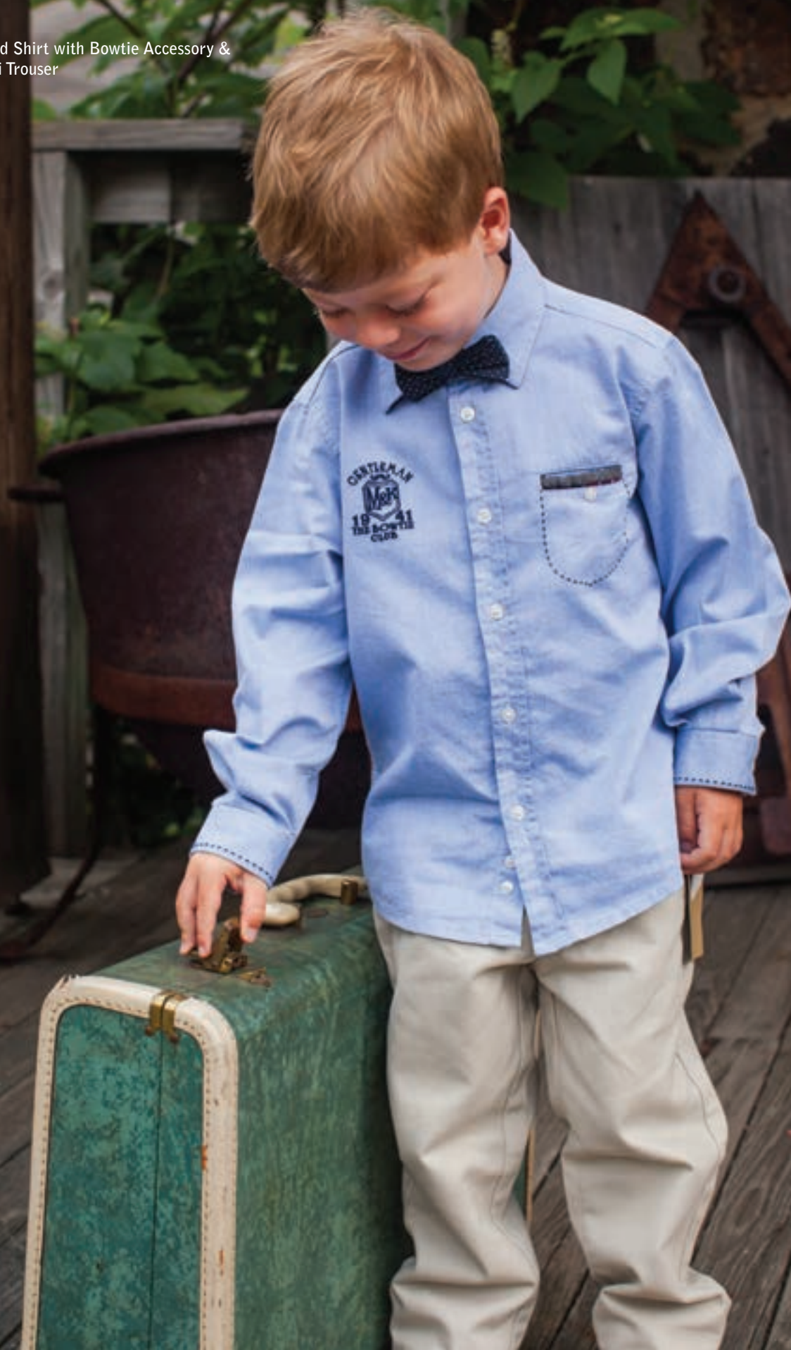
Mayoral Oxford Shirt with Bowtie Accessory & Mayoral Khaki Trouser