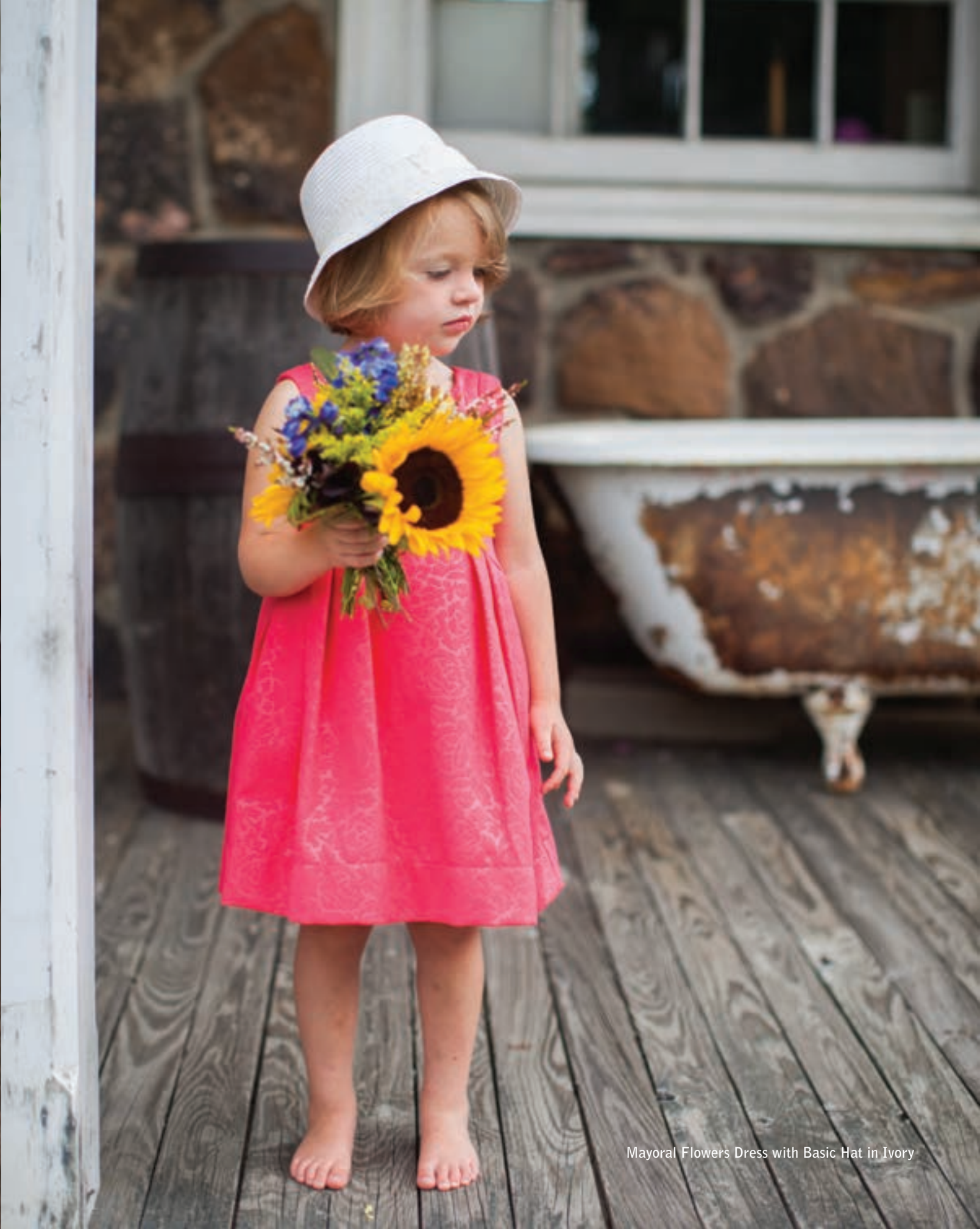
Mayoral Flowers Dress with Basic Hat in Ivory