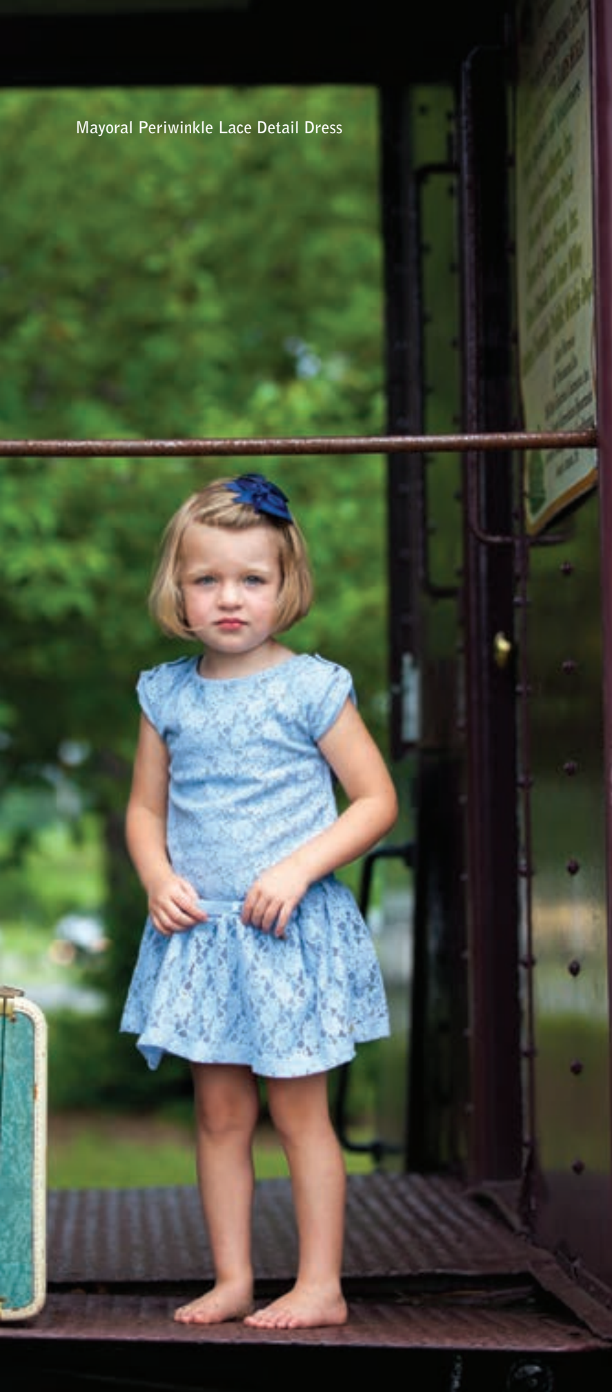
Mayoral Periwinkle Lace Detail Dress